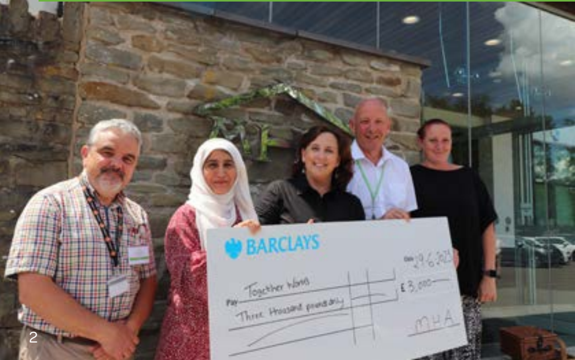
TogetherWORKS receiving £3,000 for their Corner Freezer and Store Cupboard Project