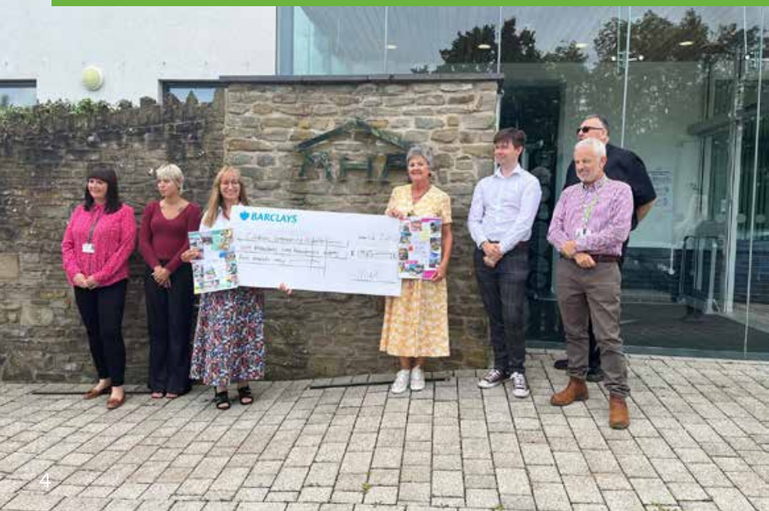
Caldicot Community Garden