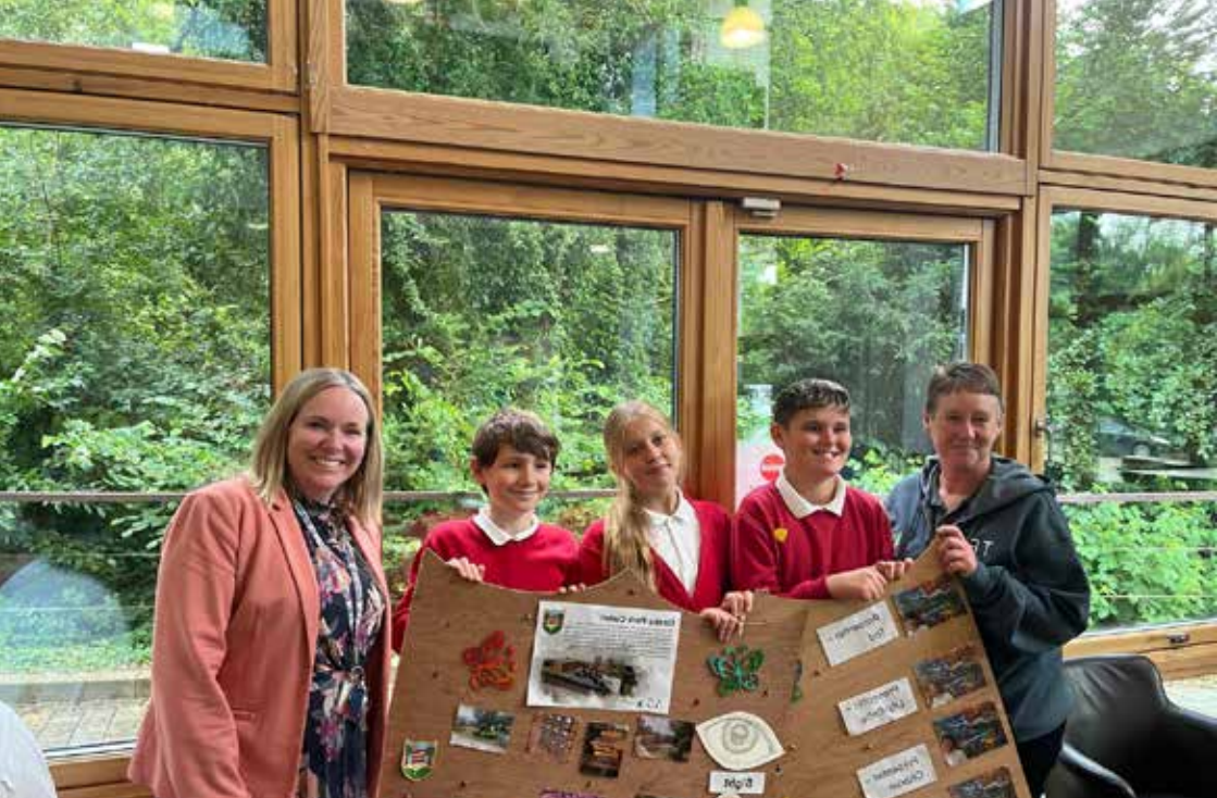
Castle Park Primary School, Caldicot