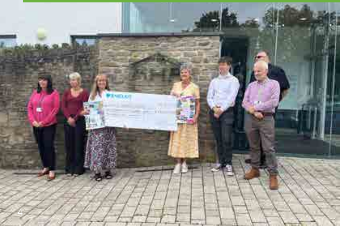
Caldicot Community Garden