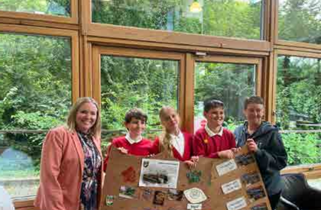
Castle Park Primary School, Caldicot